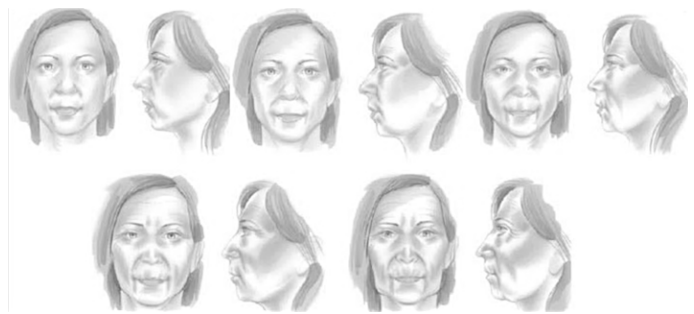
Figure 2 Global facial assessment. Grade 1: Early grade of lipoatrophy characterized by a mild flattening of several facial areas, including cheek, temple, preauricular and periorbital areas; Grade 2: an intermediate stage between grades 1 and 3; Grade 3: typified by moderate concavity and increasing prominence of body landmarks; Grade 4: Intermediate between grade 3 and 5; Grade 5: Severe indentation of one or more facial regions and severe prominence of bony landmarks. 17

Safety and tolerance were evaluated through observed side effects.